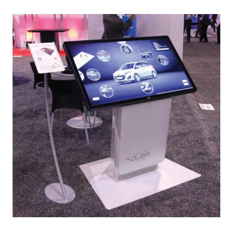
Digital signage touchscreen displays ranging from 32" up to 55" in Landscape or Portrait orientation

The launch of the Milan kiosk in early 2013 has proven successful beyond our expectations. This stunning pedestal style kiosk was developed for interactive digital signage applications, but due to its incredible adaptability, the Milan is suited for a number of other capacities. This rookie product took off in 2013 gaining wide acceptance with our digital media partners in industries such as: Gaming, Hospitality, Healthcare and Retail.