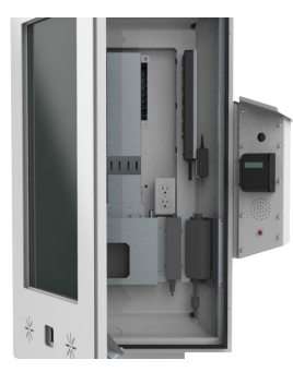
Easy to use. Easy to maintain. Easy to love.